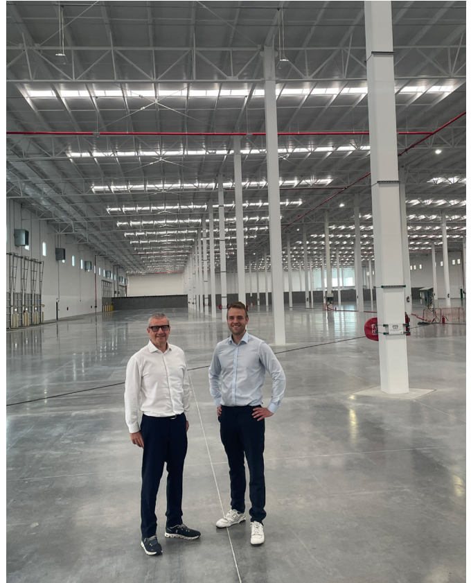
Industrial park and warehouse visit in Monterrey in northern Mexico.

The summer of 2024 will mark the beginning of a new chapter in the Mexican political landscape. The next presidential election will be held and the current president, Andrés Manuel López Obrador (“AMLO”), will need to stand down, due to constitutional laws limiting him to a single six-year term. Most people we spoke to believe that the sitting Morena party will win, given AMLO’s remarkably high approval ratings above 60%, classing him as one of the most popular presidents in the world. Former Mexico City mayor, Claudia Sheinbaum, is the front-running candidate for the Morena party and thus the most probable next president of the country. Meanwhile though, the leading opposition candidate, the outspoken Xóchitl Gálvez, has a remarkably noteworthy profile. The daughter of an indigenous father and a mixed-race mother, she comes from humble origins and has credibility as a corruption fighter. Therefore, when Mexicans go to the polls next June, they will almost certainly choose between two women for president – a first in the country’s history.