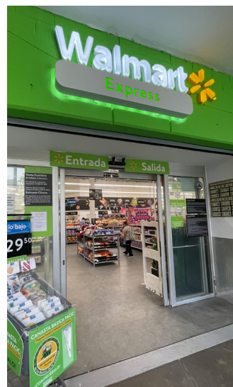
Walmex supermarket visit, tortillas in cart – ready to be put on shelves.