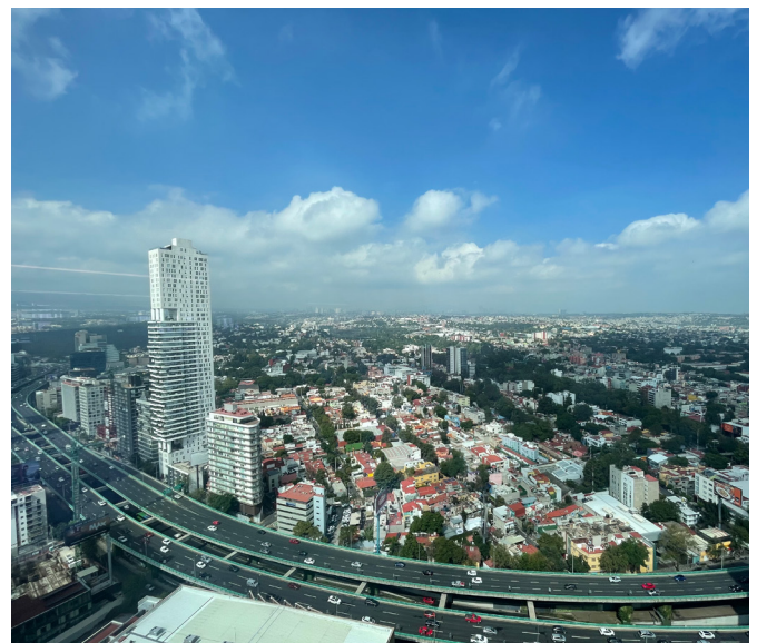
View of Mexico City from a company office.

Even though the immensely popular AMLO has promised to completely retire from politics once his six-year term in office comes to an end, he is still trying to make his mark in his final year as president. We were reminded of this when, shortly after arriving in Mexico, the government changed the regulation of the three private airport operators in the country for the first time in 25 years. With that, AMLO sent a clear message that he is still very much in charge. The Mexican airport stocks had been some of the most profitable companies and best performing stocks in the country in the last decade. It will be interesting to see if this turns out to be a one off or if regulatory interference becomes a bigger theme heading into the election next June.