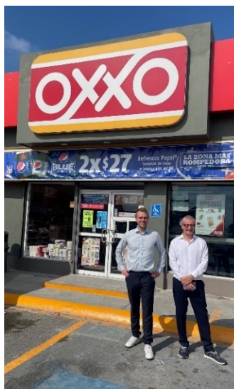
Oxxo convenience store visit, owned by FEMSA.