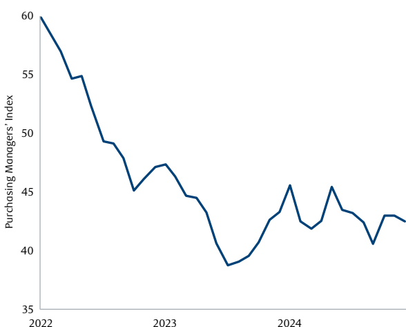
Chart 3: German manufacturing PMIs

Additionally, there are political concerns across the European major economies. The UK is currently battling with a Labour government, which has caused a collapse in business and consumer confidence. At the time of writing, UK long-term borrowing has hit levels above those seen in 2023, following Liz Truss' government's mini-budget. In Germany, citizens will be heading to the voting box after the collapse of the coalition government, following a no-confidence vote in Chancellor Olaf Scholz. Finally, France is entering another turbulent year as a result of a snap elections in the latter part of 2024, which has left the country without a solid parliamentary majority. The result of this political instability is likely to be less investment, tighter lending standards, and higher interest costs.